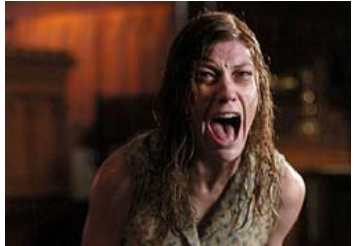
Emily Rose is possessed by six demons.

To give it some credit though, there were much