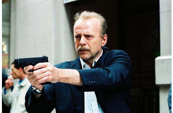
Willis holds his gun right after shooting a fellow police officer who was trying to kill Def.

job for today? Escort a prisoner 16 blocks through Manhattan to the courthouse, so that he can testify. Easy