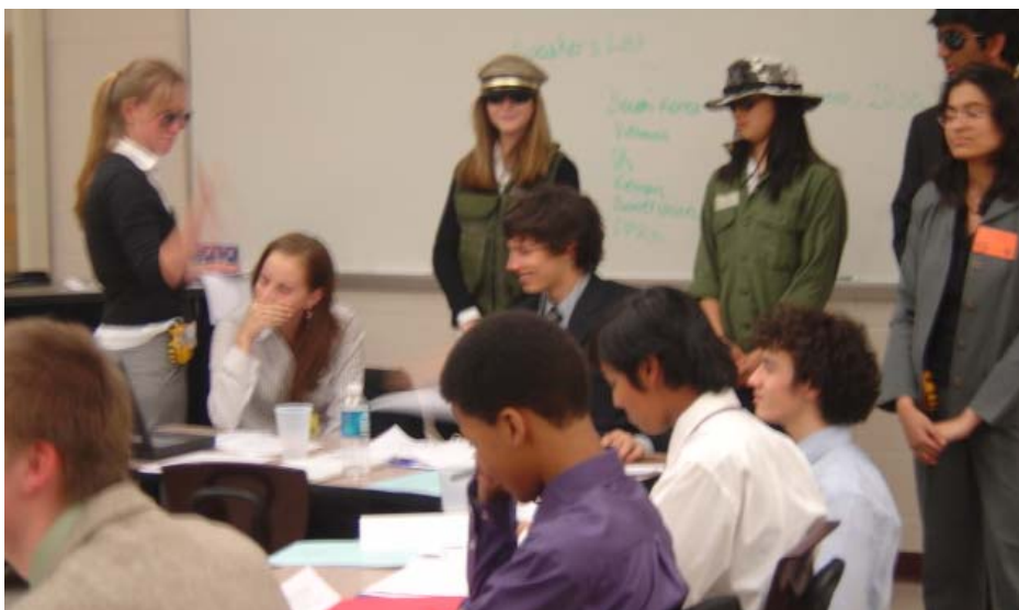
The Governor's School Model United Nations crisis committee raids a meeting in session.

GSMUN is not only a lot of fun, but also helps students prepare for the challenges facing the world today, in hopes that they can forge a better tomorrow.