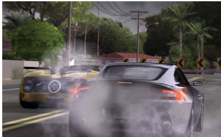
Extremely realistic graphics make XBOX 360 games electrifying.

The one thing I was very disappointed about, however, was the extremely expensive price.