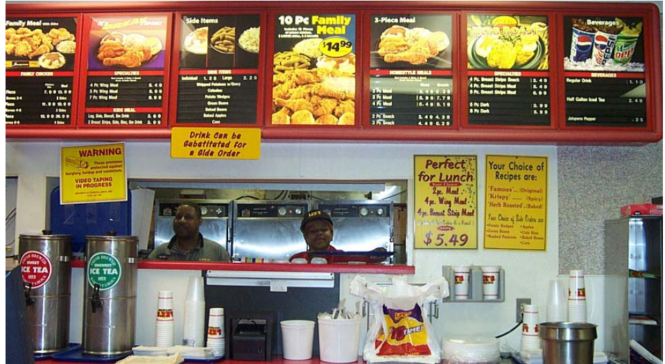
Lee’s workers always wear smiles.

Lee’s menu resembles that of many fast-food chicken restaurants, but it has a