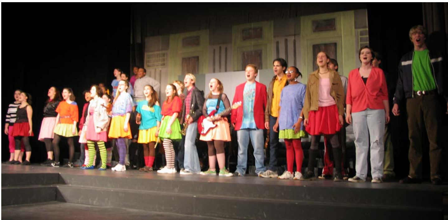
New students singing at La Guardia School of Performing Arts just after their first roll call.

Over the course of their four years the students realize that despite their diverse backgrounds they are not so different.