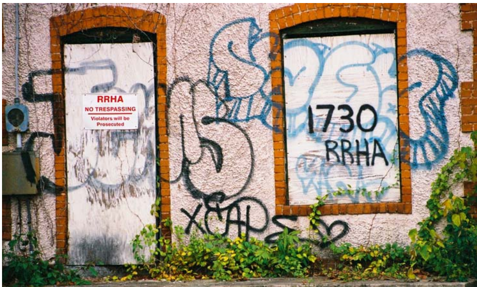
One of many neglected houses on Leigh Street that have been replaced or renovated since last year.