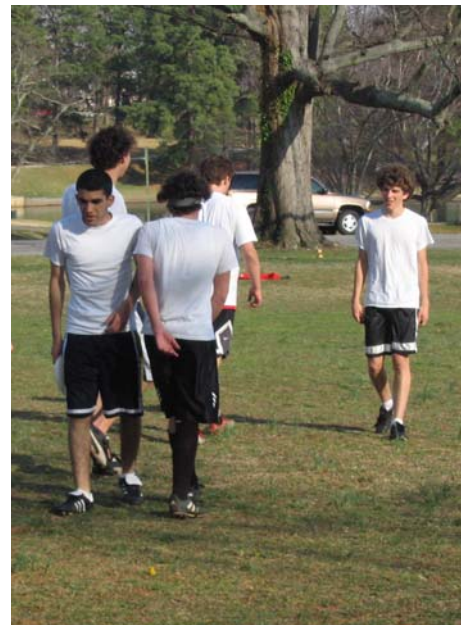
MLWGS boys line up after the game.

Aboulhosn. They practice drills such as zone defense, and occasionally scrimmage.