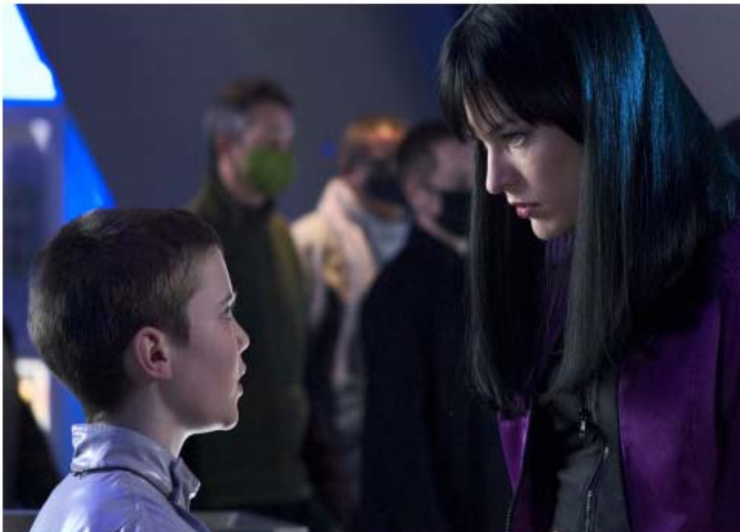
Violet (Milla Jovovich) convincing Six (Cameron Bright) to follow her to safety.

If you’re a Milla Jovovich fan, watch the preview. If not, then get a C.A.T. scan to make sure that being near this radiological spill didn’t give you a brain tumor.