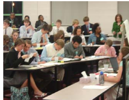
Students from visiting schools participate in the International Atomic Energy Agency.

However, there is a serious undertone to the GSMUN conference. Students are learning about conflict, peace,