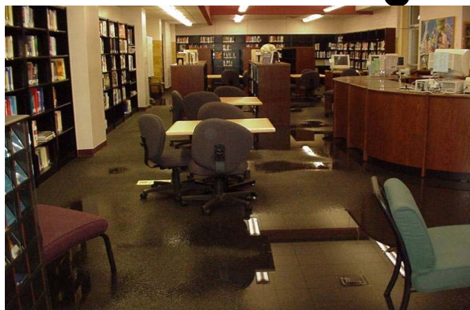
Media Center flooded.

The water seeped through the windows and