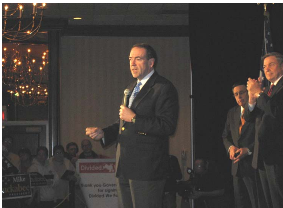
Governor Mike Huckabee campaigns in his typically witty manner at the Sheraton Hotel on West Broad Street.