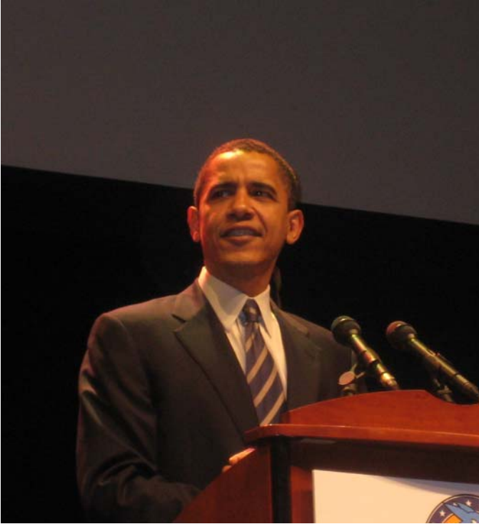
Sen. Barack Obama speaks to a crowd of 6,000 at the J.J. Dinner.