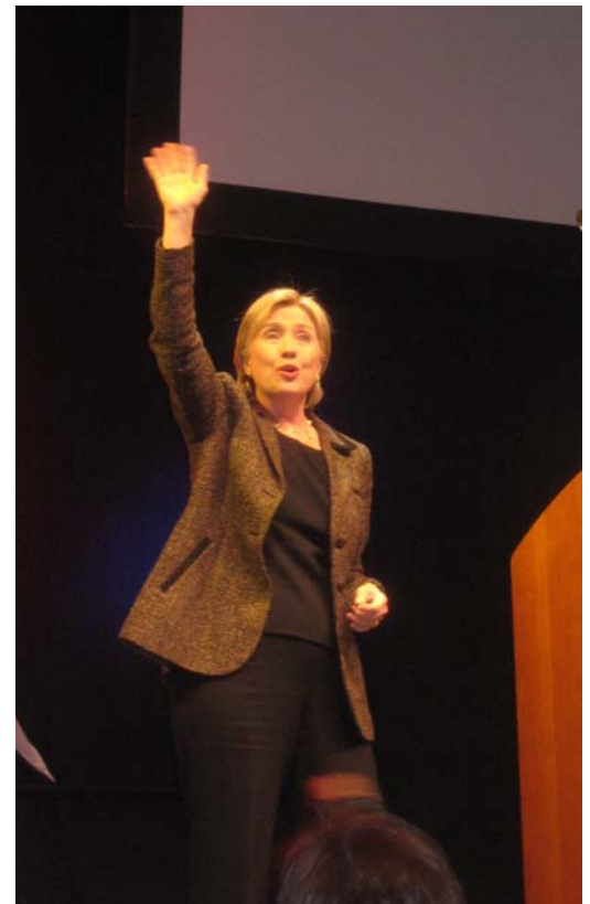
Sen. Hillary Clinton speaks to a crowd of Virginia Democrats at the J.J. Dinner.