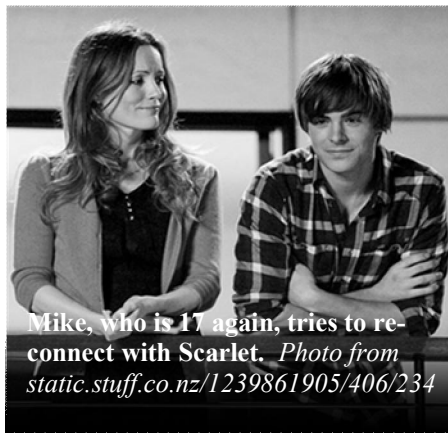
Mike, who is 17 again, tries to re-connect with Scarlet.