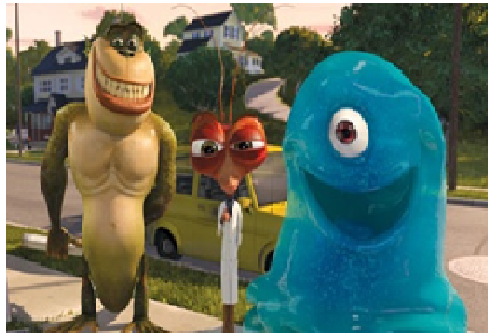
The Missing link, Dr. Cockroach, and B.O.B. meet Susan's parents.

Among them are Dr. Cockroach (voiced by Hugh Laurie), a human-sized-mad-scientist cockroach, the Missing Link (voiced by Will Arnett), half man, half amphibian, and B.O.B. (voiced by Seth Rogen), a big blue glob of goo with one eye and no brain.