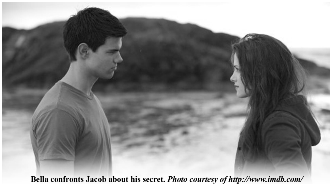
Bella confronts Jacob about his secret.